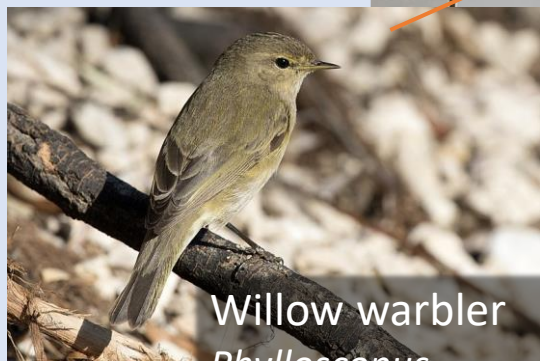
Willow warbler Phylloscopus trochilus