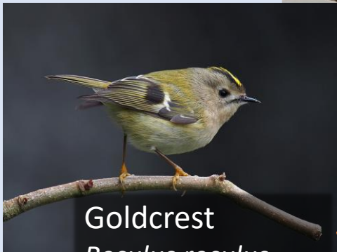
Goldcrest Reclus reculus