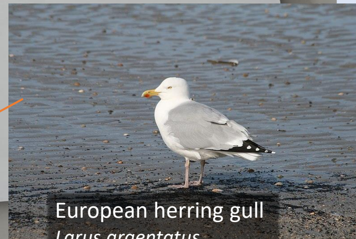
European herring gull Larus argentatus