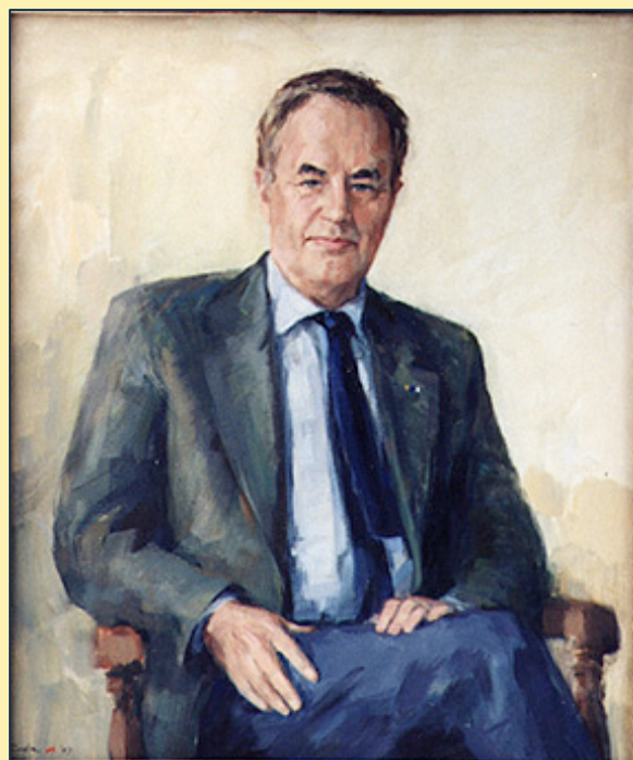
Olli Lounasmaa Physicist. Achieved the lowest temperature world wide.